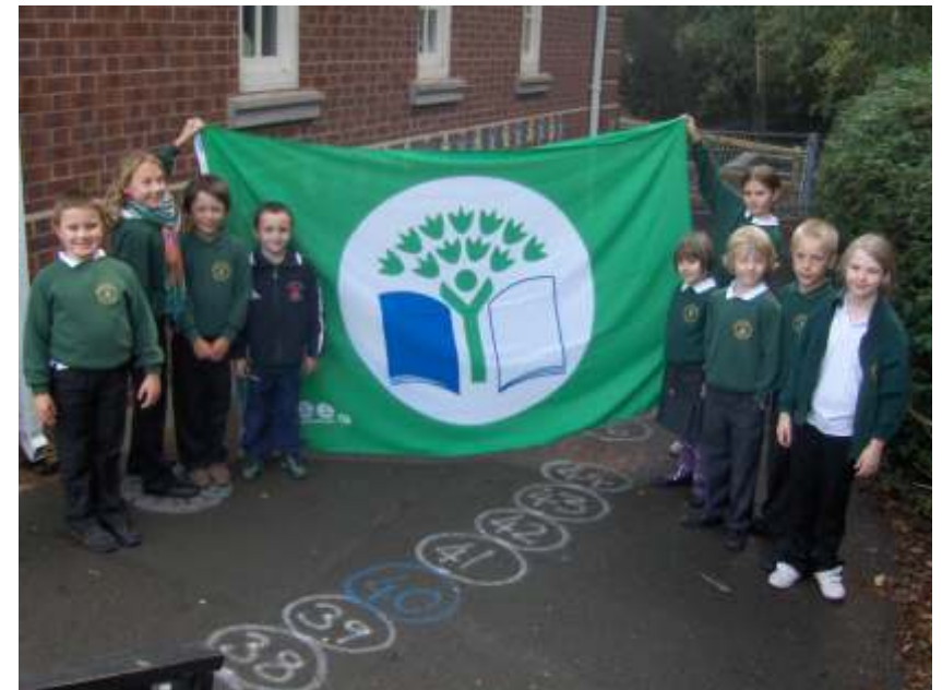
The eco-schools committee at Berriew School