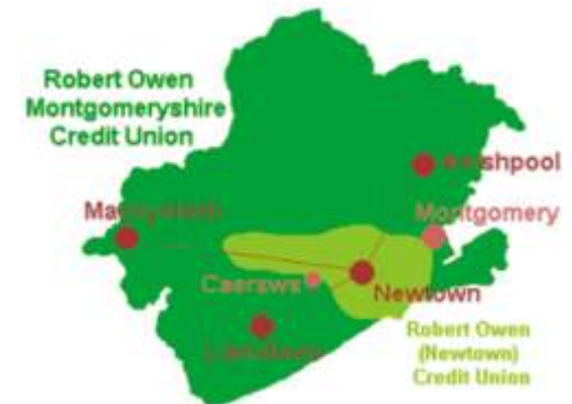
ROMCUL/RONCUL Common Bond map

In 2000 RONCUL elected to re-register its Common Bond to encompass the whole of Montgomeryshire and to change its name to the Robert Owen Montgomeryshire Credit Union Limited (ROMCUL). It now has collection points not only in Newtown but also in Llanidloes, Machynlleth, Oldford and Welshpool. Membership is open to anyone living or working in Montgomeryshire.